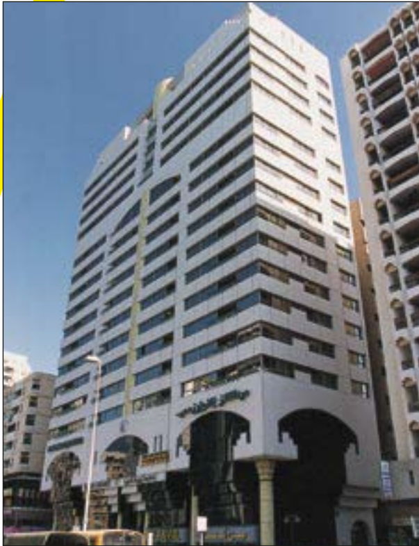
AL KHAWARIZMI CENTRE - ABU DHABI