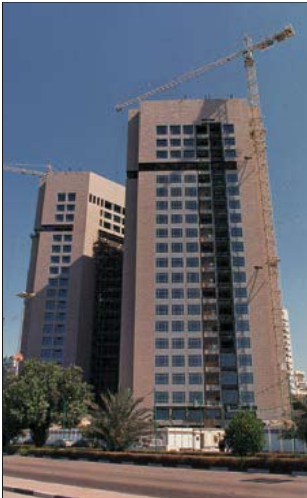
ZADCO - GASCO H.Q. - ABU DHABI