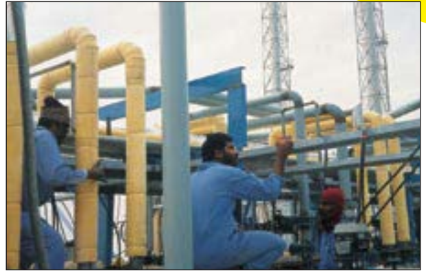
AL KHALEEJ SUGAR REFINERY - JABAL ALI, U.A.E.