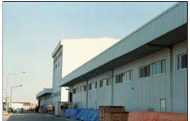
GULF CABLE FACTORY - KUWAIT