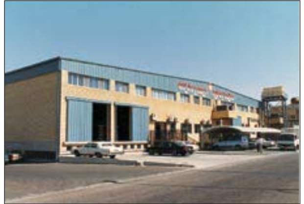
AL ADASANI PIPE FACTORY - KUWAIT