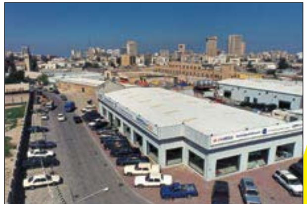
YAAS CAR SHOWROOM - KUWAIT